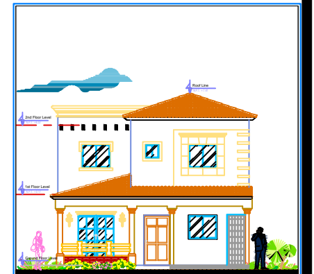
FRONT VIEW P1 BUILDING AREA 171.84M 2 SCALE 1-100